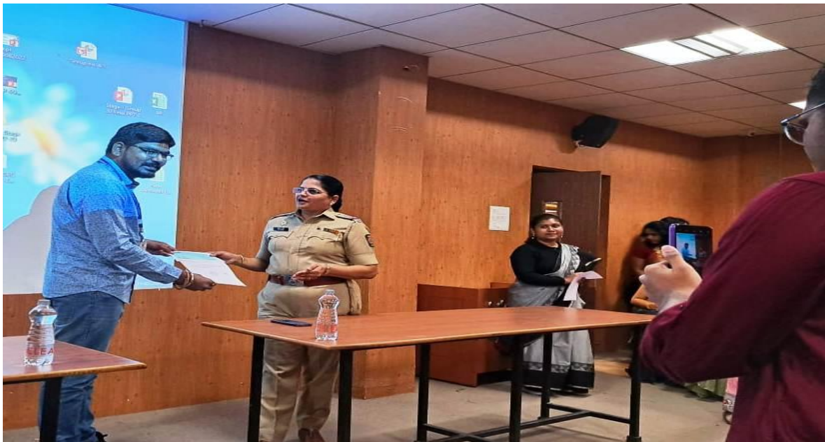
Delivering token of love and letter of appreciation