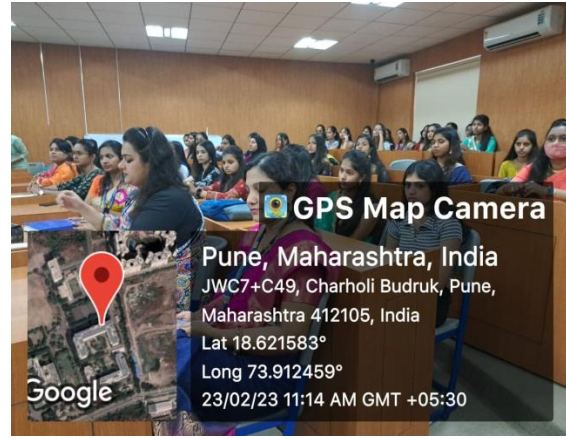
Active participant of attendee